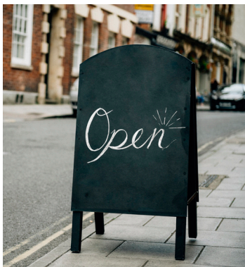
Menu & Signage Collection